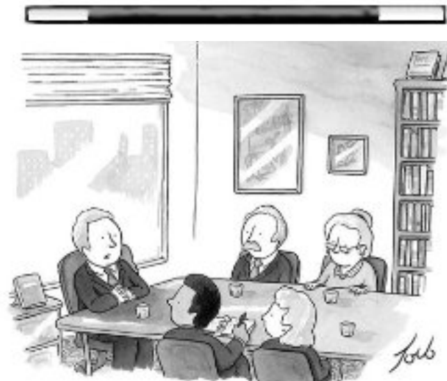
“We need to rethink our strategy of hoping the Internet will just go away.”

The same can be said of movies and TV shows. What (non-magic) books you read, what you watch and listen to shapes who you are. If you only think about magic during your show, the audience won’t feel invested in your show. On the other hand, if you are honest with the audience about who you are and what your tastes are, they will feel connected to you, and care much more about the show.