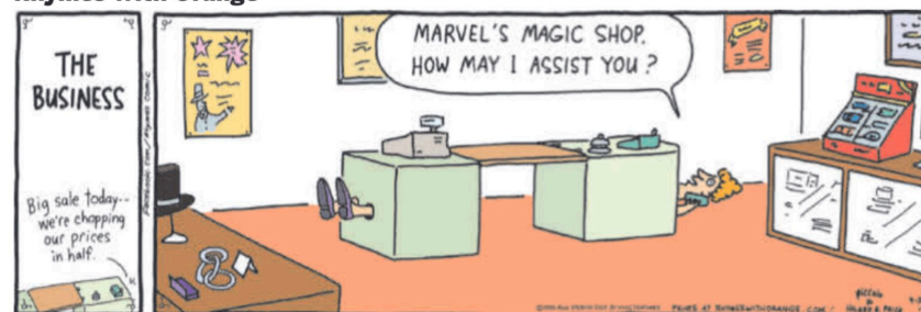
Rhymes With Orange